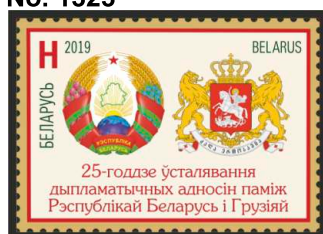
25 th anniversary of establishing diplomatic relations between the Republic of Belarus and Georgia