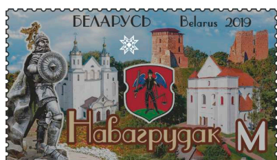
Element of protection