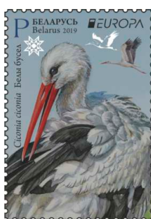
Elements of protection