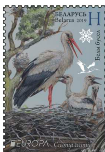
Elements of protection