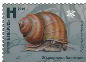
Element of protection