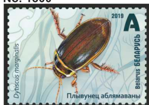
Great diving beetle ( Dytiscus marginalis )