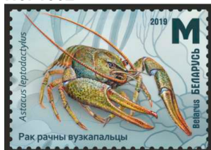
Narrow-clawed crayfish ( Astacus leptodactylus )