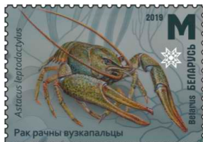
Element of protection