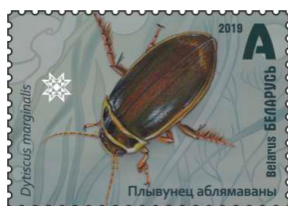
Element of protection