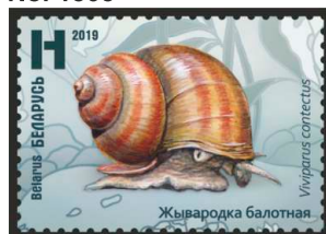
Lister's river snail ( Viviparus contectus )