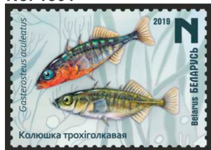
Three-spined stickleback ( Gasterosteus aculeatus )