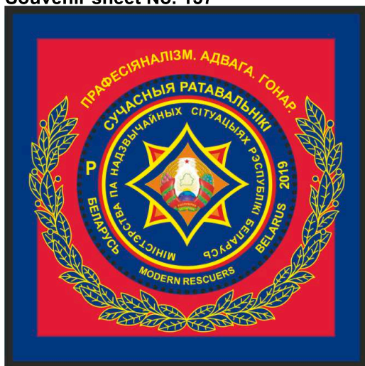
No. 1289 Modern Recuers