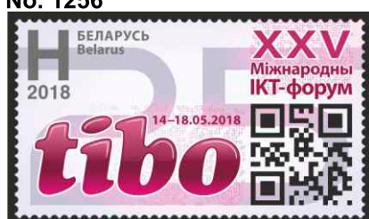
XXV International ICT Forum TIBO