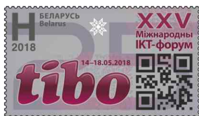
Element of protection