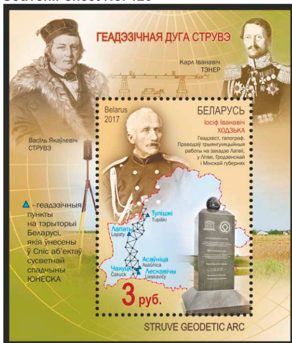
Souvenir sheet No. 126