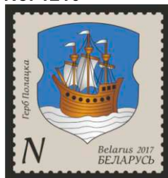
Municipal arms of Polotsk