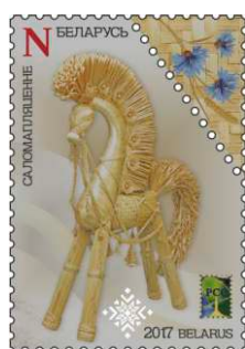
Elements of protection