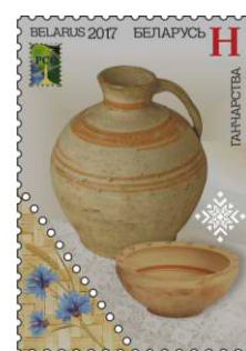
Elements of protection