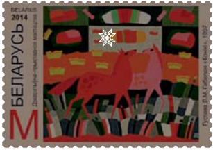
Elements of protection

Letter "A" is equal to the tariff of a letter up to 20 gram within Belarus.