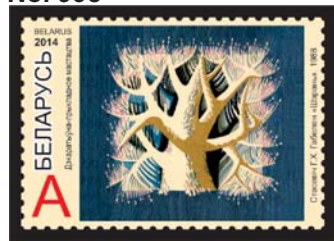
Gobelin "Hoarfrost" by G.H. Stasevich, 1988