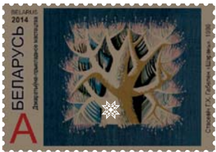
Elements of protection