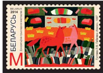
Gobelin "Horses" by L.N. Gustova, 1997