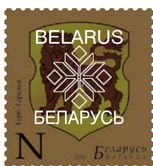
Elements of protection