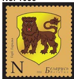
Municipal arms of Gorodok