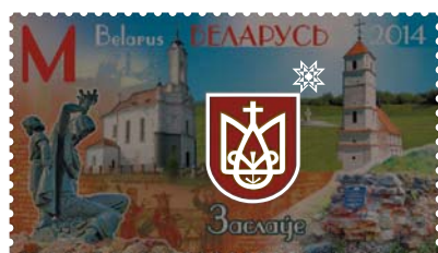
Elements of protection