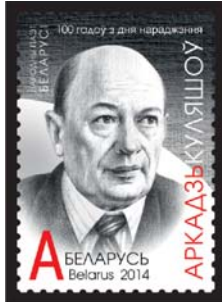
100 th birth anniversary of Arkadi Kuleshov, national poet of Belarus