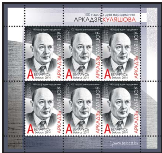
Face value A is equal to the tariff of a letter up to 20 gram within Belarus.

Historical reference: Arkadi Kuleshov (born 6.02.1914 in the village of Samotevichi, Kostyukovich district, Mogilev region - died 4.02.1978) was a Belarusian poet and translator. In 1968 he got the title of the national poet of Belarus. He was also the honored worker of culture of Ukraine (1973). His first collections of verses and poems were named “The flourishing land” (1930) and “After the song, after the sun!” (1932). Arkadi Kuleshov was the author of the following poems: “Adventures of the dulcimer” (1944), “Tsunami” (1968), “Hamutius” (1975) and others. He was awarded the USSR State Prize for his poems “The brigade flag” (1943) in 1946 and “A new direction” (1948) in 1949.