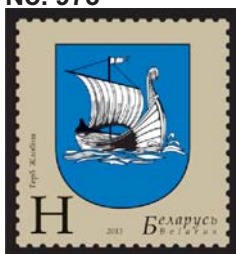
Municipal arms of Zhlobin