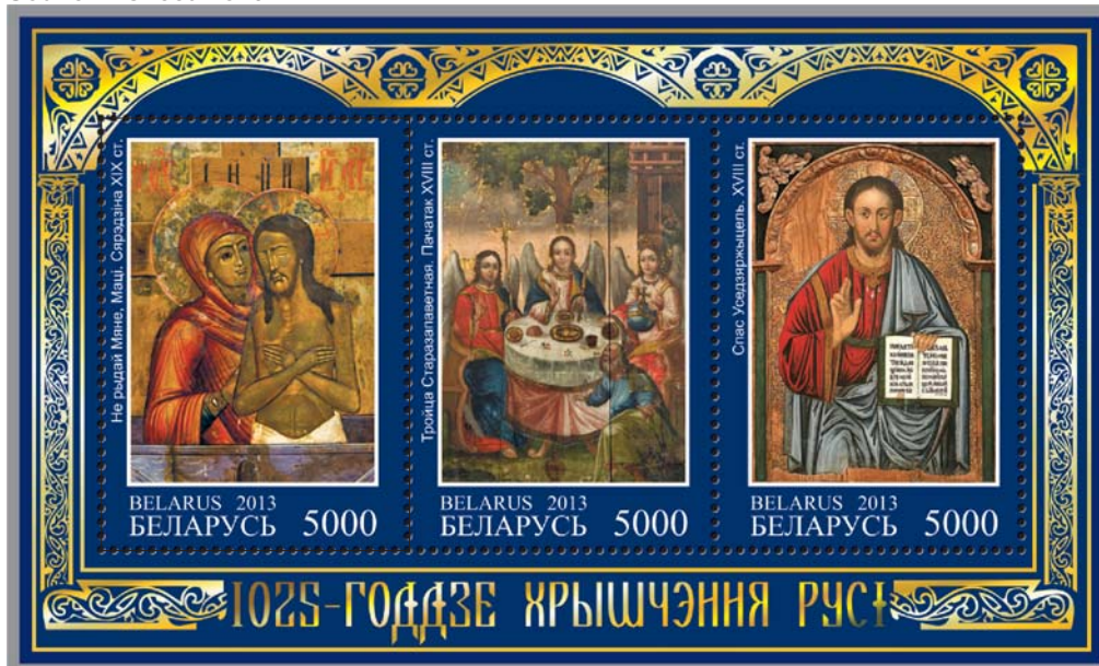
No. 969 Lamentation of Christ (the mid-19 th cent.) 5000 BYR