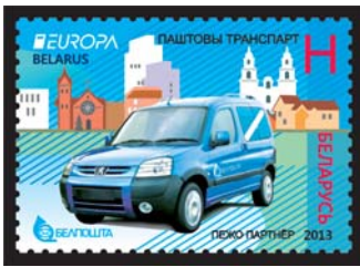
The postman van. Peugeot Partner