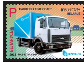
The postman van. MAZ-437143-340