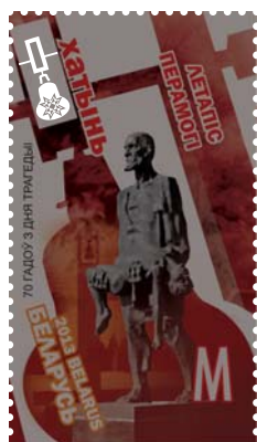
Elements of protection