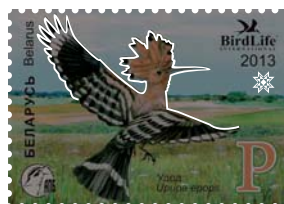
Elements of protection