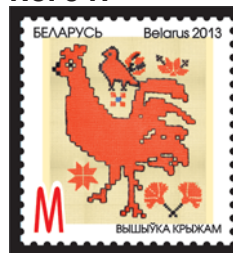
Embroidery in cross stitch M