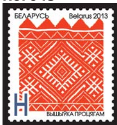
Embroidery in counted satin stitch H