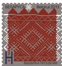
Elements of protection H