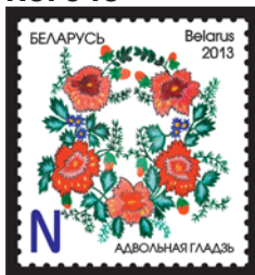
Embroidery in satin stitch N