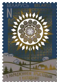
Elements of protection