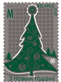
Elements of protection