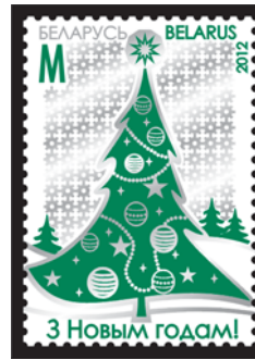
Happy New Year!