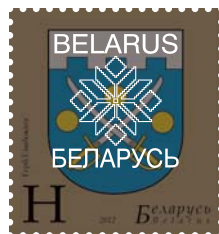
Elements of protection