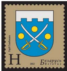
Municipal arms of Glubokoye