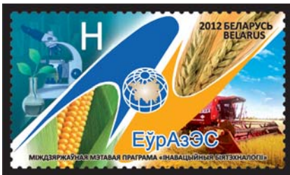
EurAsEC (Eurasian Economic Community)