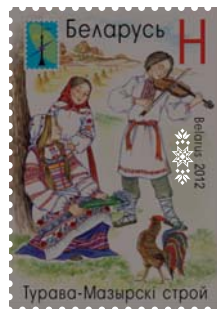
Elements of protection