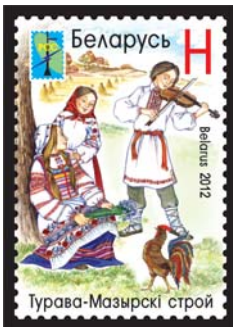
Costume of Turov and Mozyr region