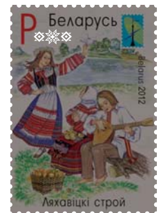
Elements of protection