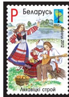
Costume of Liahovichi region