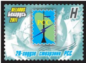
20 th anniversary of the RCC H