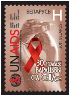
30 years of AIDS prevention