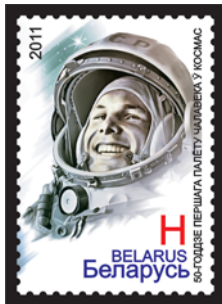
50 th anniversary of the first manned space flight