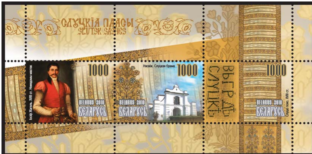
No. 816 Iosif Zhagel. 18 th century Unknown artist 1000 BYR