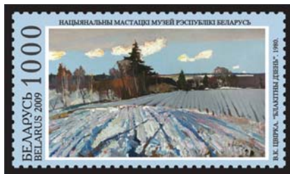
V.K. Tsvirko “Sky-blue day”. 1980