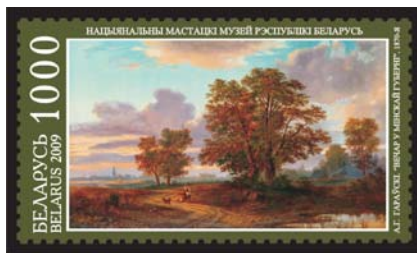
A.G. Goravsky "Evening in the Minsk province" 1870-ies