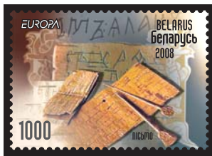
Birch bark letter