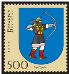
Municipal arms of Turov.