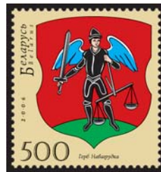
Municipal arms of Novogrudok.