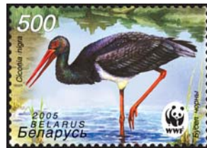
Black stork in water. 500 BYR