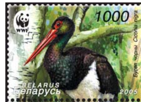
Black stork in the nest. 1000 BYR