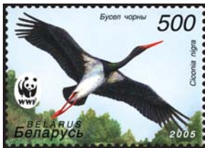
Black stork flying. 500 BYR