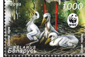
Black stork — nestlings. 1000 BYR

The stamps are issued under the aegis of the nature protection organization World Wide Fund for Nature (WWF).